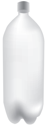
Empty plastic bottle with cap